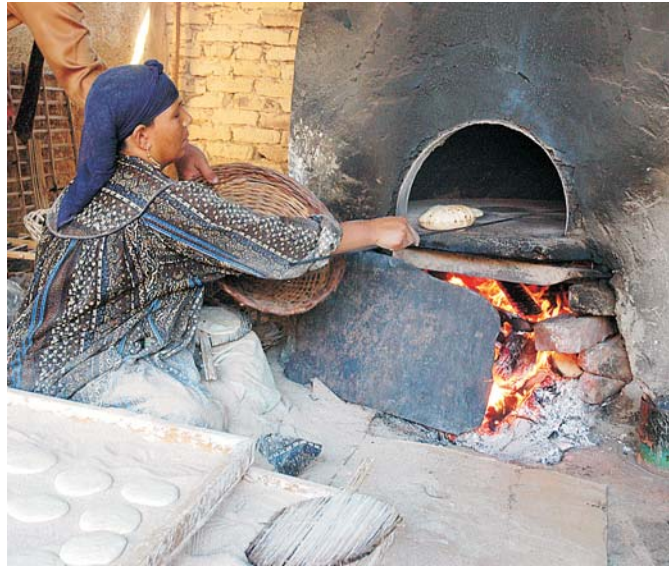
A woman baking bread near Memphis, Egypt.

Opportunity for worship. Today we will visit the Great Pyramids and the Sphinx, sole survivors of the Seven Wonders of the Ancient World. At Memphis, capital of the ancient kingdom, we will see the Alabaster Sphinx and the beautifully carved statue of Ramses II. Continue to Sakkara and the Step Pyramid of Djoser (Zoser). B, D