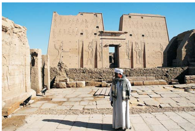
The temple of the sun god Horus was begun by Ptolemy III in 237 B.C. at Edfu.

Cross the Nile by ferry to the West Bank and Thebes, the burial ground of the great pharaohs of the New Kingdom period (1546-1085 BC). Drive past the famed Colossi of