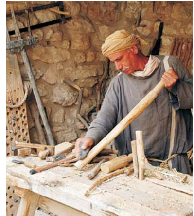
Carpenter at the Nazareth Village

meaning from now on, and our “world” will be a great deal larger.