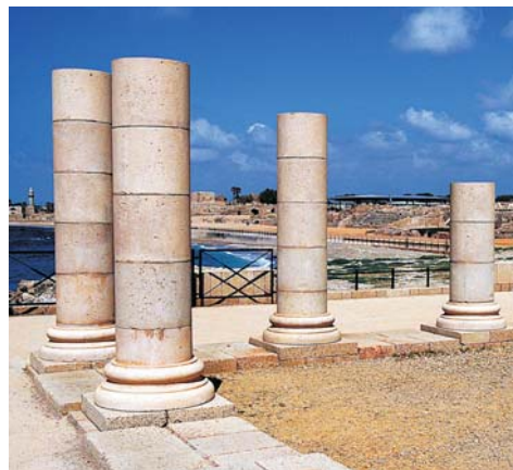
Herod's Palace at Caesarea Maritima

Drive north to Caesarea, first century Roman capital and seaport. The gospel was first preached to the Gentiles here (Acts 10, 11). Paul was imprisoned here for two years before departing for Rome (Acts 24:27; 27:1). See Crusader's city walls, Herod's palace, the harbor, the Roman theater, and the aqueducts. Further north we arrive at Haifa, Israel's second largest city, industrial center, and seaport. Ascend beautiful Mt. Carmel for a magnificent view of city and harbor. Visit Murakah, the site associated with Elijah and the prophets of Baal (1 Kings 18). From here we have a view over the valley of Megiddo. In the Valley of Jezreel (the Armageddon of Rev. 16:16) we come to Megiddo. Visit the model at the visitor's center, see ruins of the city including the gates and stables. Walk through the ancient water tunnel. We will make a brief stop in Nazareth, boyhood home of Jesus. One of the highlights here will be a visit to the Nazareth Village, a reconstructed first century village and farm. Heading toward Tiberias we pass Gath-hepher, home of Jonah (2 Kings 14:25), and the traditional Cana