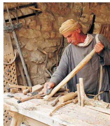
Carpenter at the Nazareth Village

Arrival in New York is scheduled for the early morning.