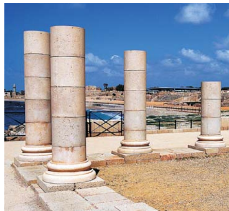
Herod's Palace at Caesarea Maritima

Drive north to Caesarea, first century Roman capital and seaport. The gospel was first preached to the Gentiles here (Acts 10-11). Paul was imprisoned here for two years before departing for Rome (Acts 24:27; 27:1). See Crusader's city walls, Herod's palace, the harbor, the Roman theater, and the aqueducts. Further north we arrive at Haifa, Israel's second largest city, industrial center, and seaport. Visit Murakah, the site associated with Elijah and the prophets of Baal (1 Kings 18). From here we have a view over the valley of Megiddo. In the Valley of Jezreel (the Armageddon of Rev. 16:16) we come to Megiddo. Visit the model at the visitor's center, see ruins of the city including the gates and stables. Walk through the ancient water tunnel. We will make a brief stop in Nazareth, boyhood home of Jesus. One of the highlights here will be a visit to the Nazareth Village, a reconstructed first century village and farm. Heading toward Tiberias we pass Gath-hepher, the home of Jonah (2 Kings 14:25), and the traditional