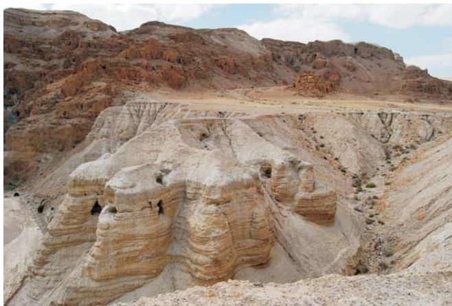
Cave 4 at Qumran where some of the Dead Sea Scrolls were found.

Today we descend through the wilderness of Judea to Jericho (Josh. 2:1–6:20) where the walls fell down. Visit Qumran where the Dead Sea Scrolls were found. Driving south along the Dead Sea we pass Ein Gedi where David hid from Saul (1 Sam. 24), and come to Masada, Herod's rock fortress which overlooks the Dead Sea. Here, in A.D. 73, 960 Jews took their own lives rather than submit to the yoke of Rome. Return to Jerusalem for overnight.