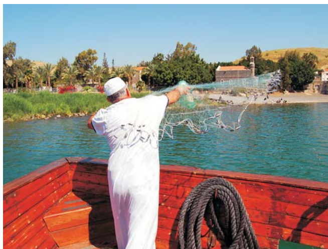
Fisherman casting net on the Sea of Galilee

Mount Gilboa, Hill of Moreh, and Mount Tabor as we motor through the Valley of Jezreel. See the site of ancient Jezreel where King Ahab built a palace (1 Kings 21:1-2).