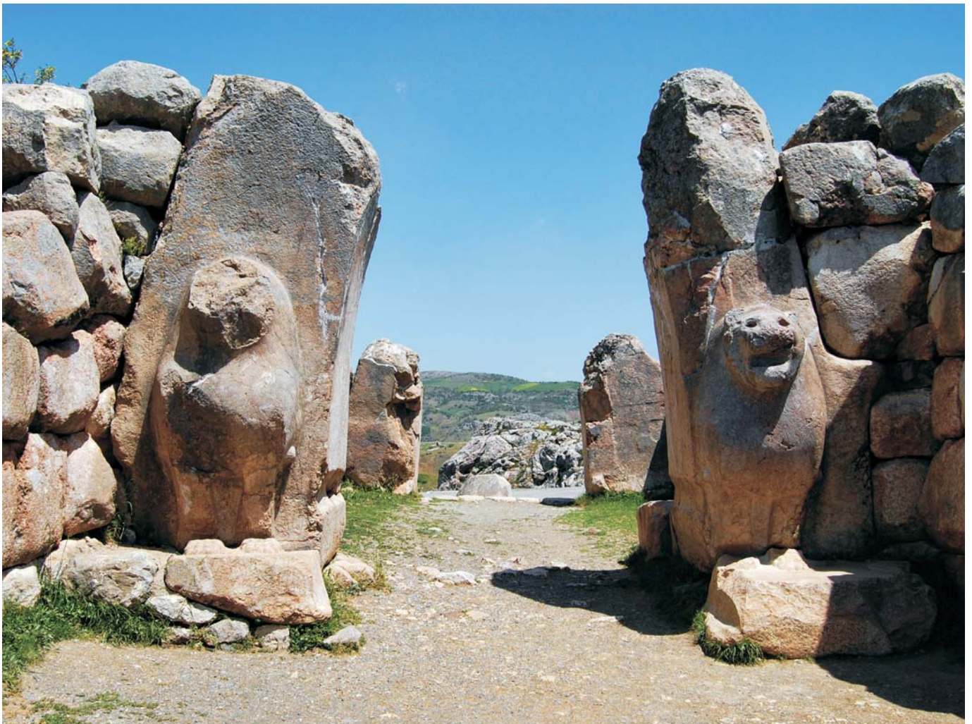
The Lion Gate of Ancient Hittite City of Hattusas (now Bogazkale)

May 5 – 19, 2014 – Our 82nd Foreign Tour –